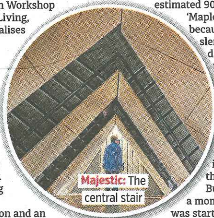
Majestic: The central stair

■ If you'd like to get your hands on one of these award-winning homes (located at 11 Mapleton Crescent, SW18 4GY, alongside River Wandle and just a stone's throw from amazing local facilities), you will need to hurry, as 70 per cent have already been reserved. For more information visit pocketliving.com